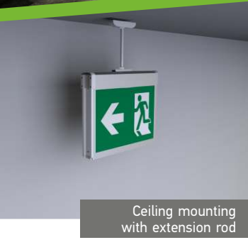
Ceiling mounting with extension rod