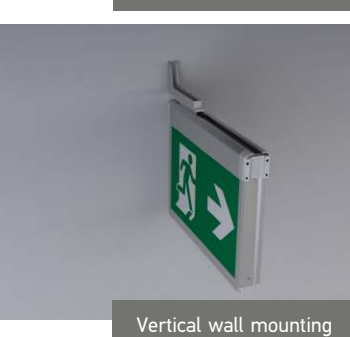
Vertical wall mounting